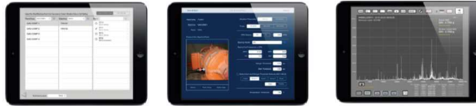
Create, Edit and Manage Routes