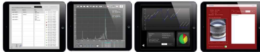
View Plant Status